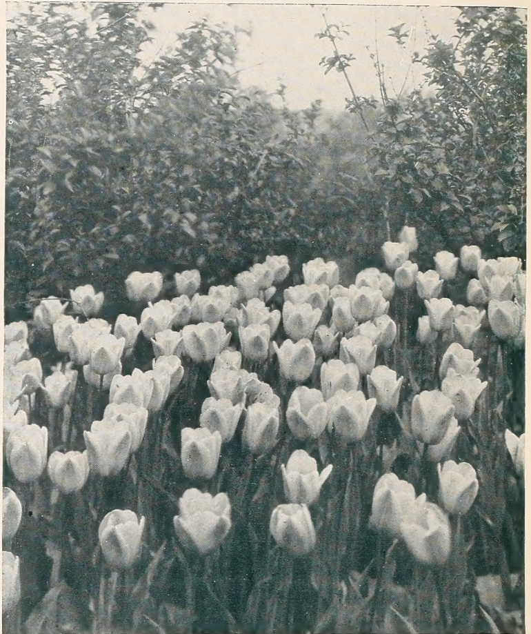
Planting of Breeder Tulips